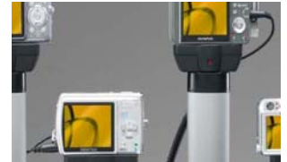
An example of InVue’s PODS™

First Choice will focus on this new business early in the New Year but, if you wish to know more about our strategic partner, InVue, visit their website at: http://www.invuesecurity.com/about.html .