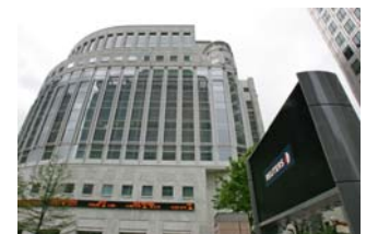
Thompson Reuters, Canary Wharf and host to the ASIS International Seminar that First sponsored in November. See Page 3 for details.

new and better systems that allowed for more professional costings. BD, being responsible for rebids as well as growth and new opportuni-